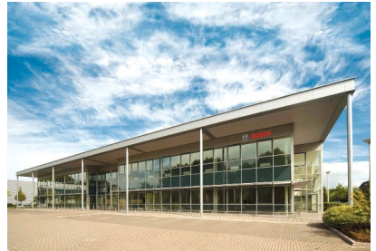
The Service Training Centre in Uxbridge

Built to Bosch's Global Training Centre standards, the Service Training Centre offers 2,000 square metres of space overall with 4 dedicated classrooms and 1,000 square metres of workshop space.